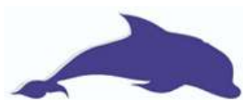
Eastcoast Dolphins Women's Hockey Club