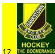
Bankstown Sports Hockey Club