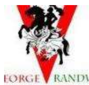
St George Randwick Hockey Club